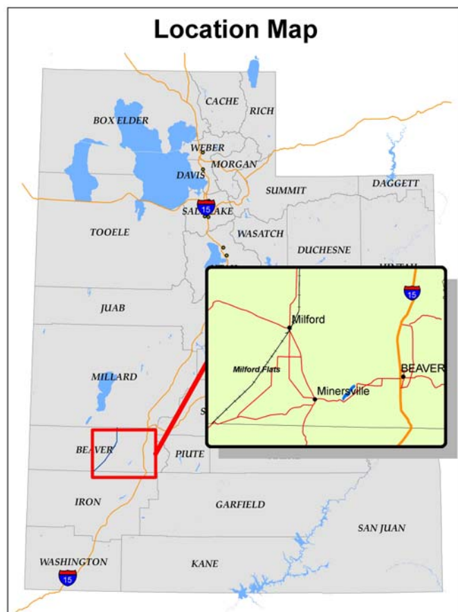
Map A: Map of Beaver County

The 2000 Census estimates Beaver County's population at just over 6,000. This represents a 25% increase from 1990, a dramatic increase compared to previous rates of growth. The recent population increase has resulted in a more