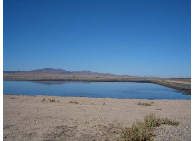
Photograph of one of the open pit lagoons containing hog waste

odors was experienced by the residents that lived on the Milford Flats, an area situated relatively close to the barns. One respondent stated that “it totally changed our lifestyle; you couldn’t have picnics or BBQs or work out in your yard. The boys would go out to change the water and start dry heaving” (James, B. 2006).