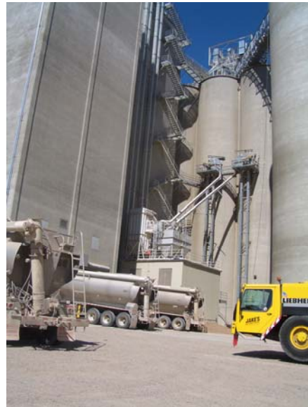
Feed mill in Milford

The barns are geographically separated for health reasons, which segregate the animals into farming units with the associated hog populations—a