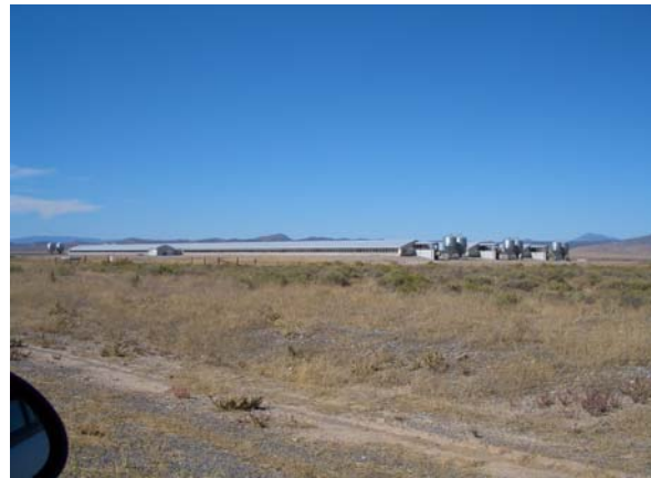
Photograph showing one of the dozens of barns containing hogs

Circle Four Farms began construction in late 1993 and finished their first complex a couple of years later. The barns associated with Circle Four are not the buildings normally associated with traditional agriculture. These barns consist of multiple long, low-lying metal buildings set on concrete foundations.